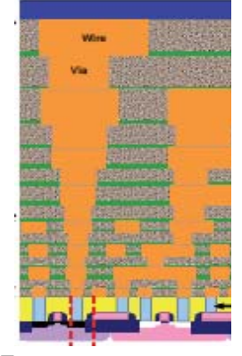
Fig. 2 Interconnect structure (from ITRS roadmap)

electrical properties of hetero-interfaces. Based Based on the obtained results, we can overcome overcome technical challenges associated with the fabrication of advanced LSI devices. It It is also possible to provide vital information information for the development of various various devices, such as oxide TFT. MIM capacitors, MRAM, and any hetero structures which require nano-scale interface.