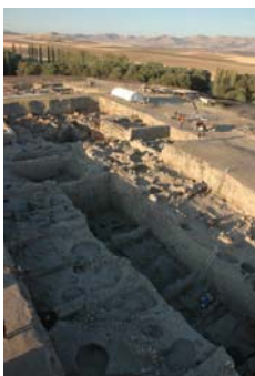
Fig.1 North Sector of Kaman-Kalehöyük

In Anatolian archaeology, there are only a few examples of the cultural chronology from Ottoman period through Neolithic period constructed based only on one site. Kaman-Kalehöyük situates in the middle of Republic of Turkey. One of its characteristics is that cultures from east, west, north and south of the world have met at the site, and that they have been piled up there. This research will show what kind of cultural role Anatolia played, which situates in the center of the Middle Eastern world, in the prehistoric period.