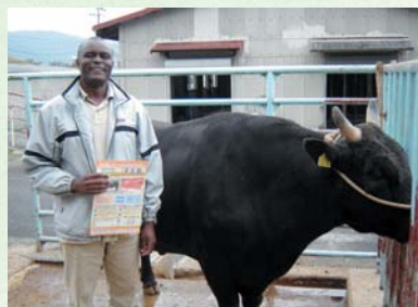
Standing next to Japanese black bull in Shimane Prefecture