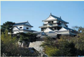
Shikoku's largest Matsuyama Castle

Matsuyama is the largest city of Shikoku, which is located across the Inland Sea and is one of Japan's four main islands. Matsuyama is known as both a center of culture and education, hosting as it does Ehime University. Historically, Matsuyama is an old castle town, preserving many traditional structures and settings. Matsuyama Castle, built in the early 1600s, is one of Japan's most exquisitely preserved castles.