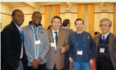
With colleagues at social function at Kyoto University