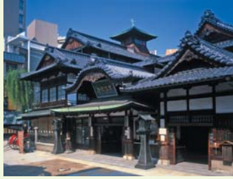
Main bathhouse at Dogo Spa

The Dogo Spa also has old inns and bathhouses that are considered treasures of traditional architecture. Its drum is beat at 6 a.m. and then again at noon and in the evening in the traditional manner of an old spa where people would lodge and soak themselves in the hot tubs several times a