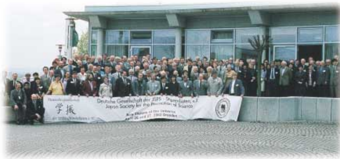
Participants of symposium in Dresden