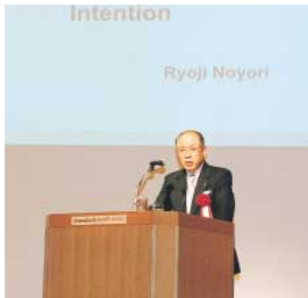
Commemorative lecture given by Dr. Noyori