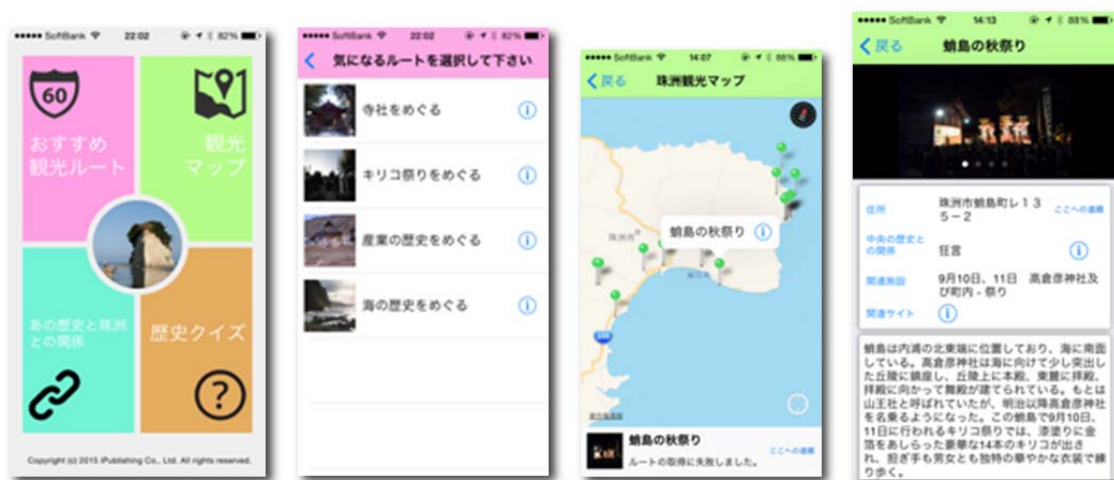
Figure 2: Academic Regional Tourism App (for iPhone)