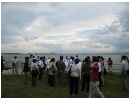
At Fujimae Tidal Flat

On the afternoon of the 19 th , field trips were made to the Fujimae Tidal Flat and Kaisho Forest, where the young researchers received explanations and held discussions on activities to conserve the ecosystems and the creatures that inhabit them.